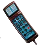
Premium manual switch