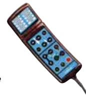
Komfort manual switch