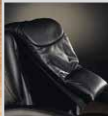
2 detachable pads