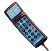
High-tech manual switch