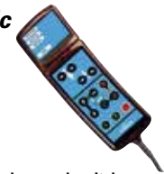
Standard manual switch